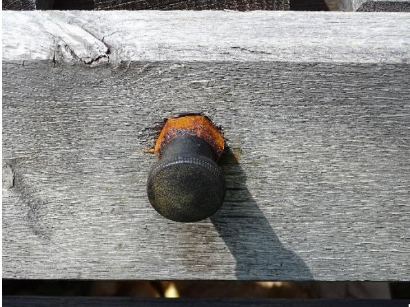
Figure 7: Rusted cover lid.