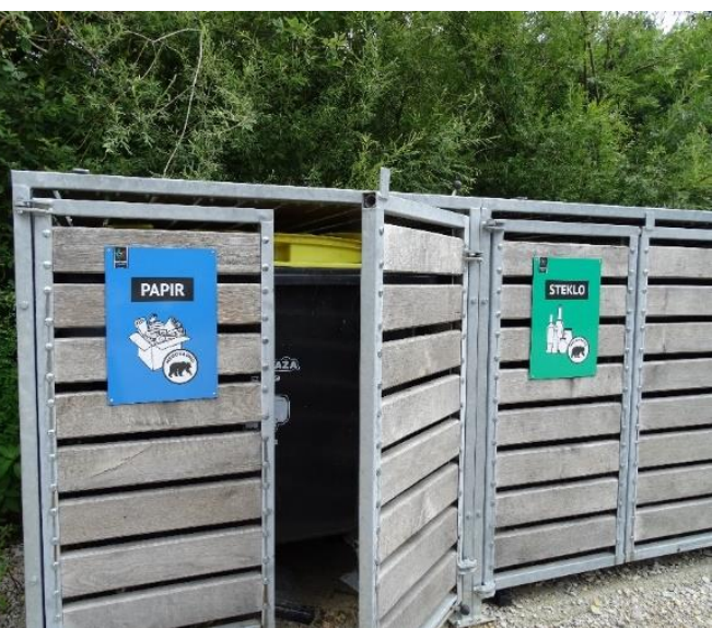
Figure 4: Opened door of the garbage housing.