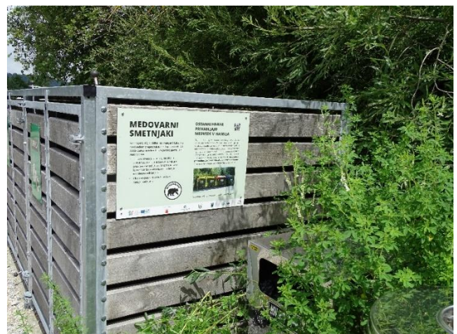
Figure 1: Information board for raising awareness about the importance of bear-proof garbage cans with recommendations for proper usage.

In addition to the fact that the lake surroundings are exposed to visits to bears, it is also a popular tourist destination and therefore of particular importance. For this reason, we found this location (see map 2) very suitable to raise awareness (figure 1) among local people and also tourists. We set up twelve bear-proof enclosures for garbage cans (figure 2) to prevent bears coming to that site. For keeping bears away from human settlements, we equipped sixteen households and one holiday cottage with bear-proof compost bins (see map 2).