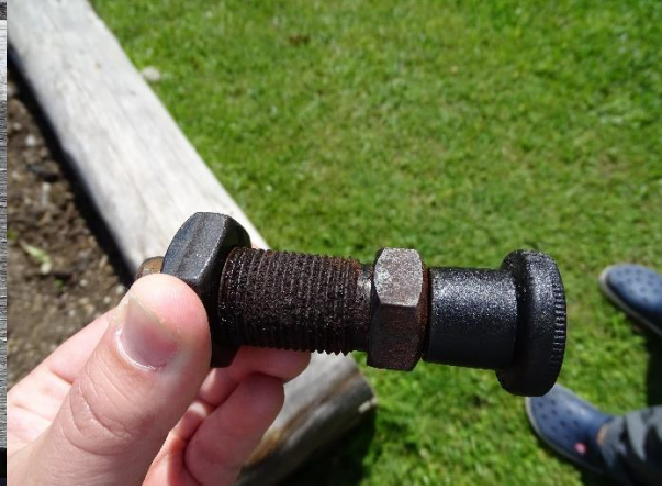
Figure 8: Removed cover lid and coated with a rust-remover and installed back after the remediation.

After the implementation of the measure, the inhabitants do not perceive the presence of a bear in the near vicinity of houses. For that reason, all of the recipients are highly satisfied (figure 9) with their compost bin, since they are serving their purpose very well.