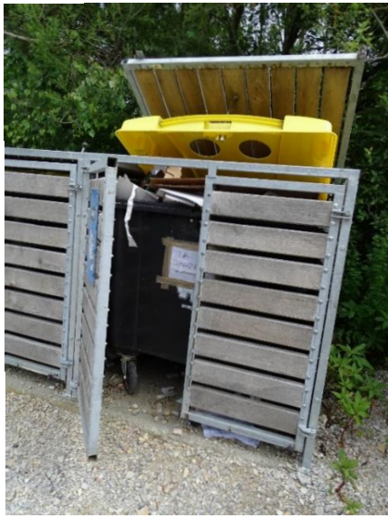
Figure 3: Overfilled garbage container.