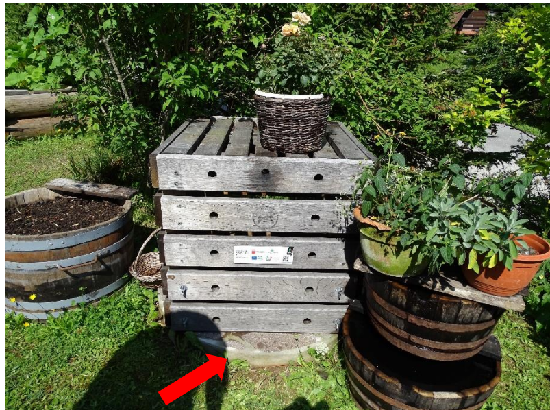
Figure 6: Additional fixed “bear-proof” compost bin to the base concrete slab.

Besides anchoring, some of the users fixed their compost bins to the base concrete slab to protect them additionally (figure 6). This points to great understanding of the implemented measure purpose and additional inventiveness of the compost bin owners.