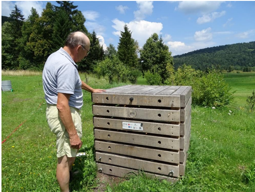
Figure 9: One of the very satisfied “bear-proof” compost bin owners.

At the beginning of the winter, only one recipient observed bear's traces and scats around the compost bin. Nevertheless, the compost bin has remained untouched, since its contents were not available for the bear. This is an additional confirmation of the effectiveness of the implemented measure.