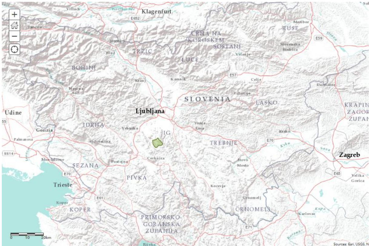
Map 1: Location of the settlement Rakitna in Slovenia (in green).

Rakitna (see map 1) is situated at the area, surrounded with forest. Besides conflict that occur between humans and bears, because of numerous tourists and therefore raising awareness, implementation of such measure in this »hot-spot« is of great importance. Before bear-proof garbage housings for large (~ 1000 litre) containers at Lake Rakiško surroundings and compost bins at the southern part of the settlement were set up. Before the measure implementation, bears often approached to the human settlements because of the open compost bins and therefore available anthropogenic food.