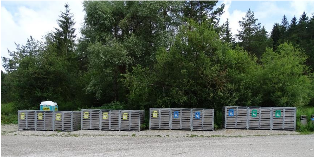
Figure 2: “Bear-proof” garbage housings for large (~ 1000 litre) containers at Lake Rakiško surroundings.