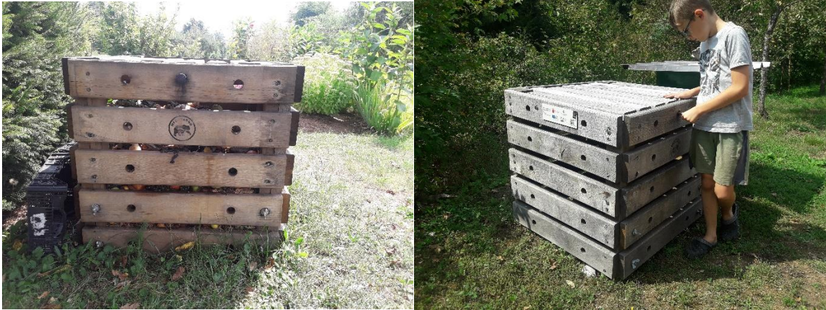
Figure 3-6: good operation of the »bear-proof« compost bins.

During our control visits we only noticed some smaller irregularities: