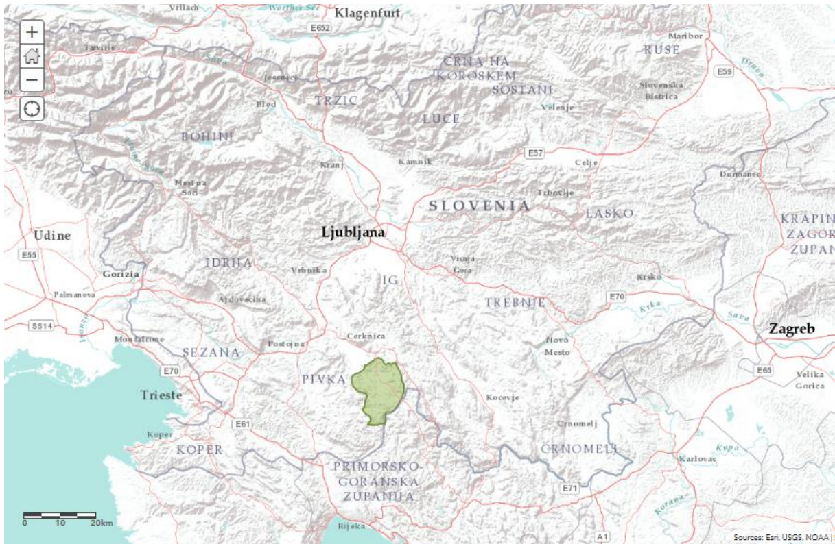
Map 1: Location of the municipality of Loška dolina in Slovenia (in green).

In the municipality of Loška dolina (see map 1) bears often come to the nearest vicinity of the settlements. One of the most attractive is the area at the eastern part of the city Stari trg pri Ložu, named Ograde. This settlement is surrounded by forested area. The most numerous conflict situation occurs in the street in the immediate vicinity of the forest. For that reason, in this area we installed the bear-proof individual garbage cans. The implementation of the measure was carried out in close cooperation with the municipality of Loška dolina.