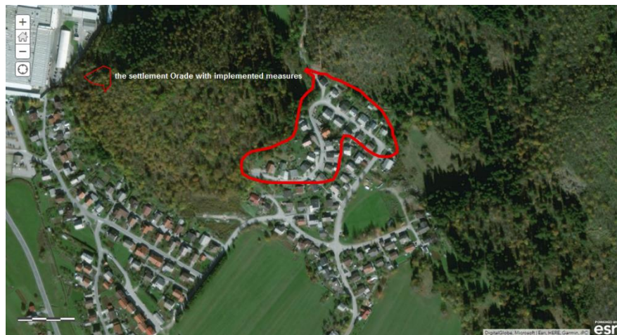
Map 3: Ograde, the area where the individual garbage cans and compost bins were distributed.