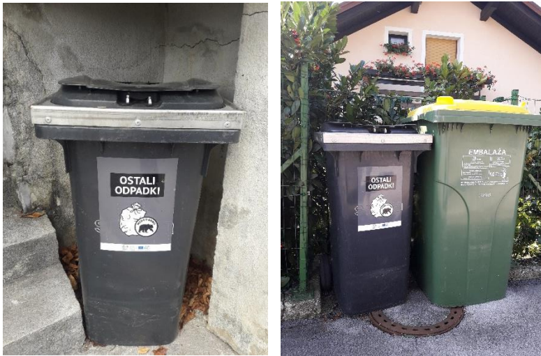
Figure 1 and 2: Individual »bear-proof« garbage cans for mixed municipal waste collection. All of the garbage cans are equipped with a sticker with LIFE and NATURA 2000 logotype and LIFE DINALP BEAR project acronym, to provide information about their “bear-proofness”.

the garbage cans but do not succeed in opening it. Because they do not access the contents of the garbage cans, in general they are not interested in overturning it anymore. For us, this is an additional approval that implemented measure effectively deterrent bears from human settlements.